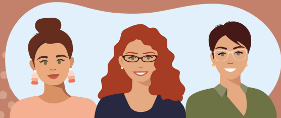
Town of Leesburg Preservation Staff