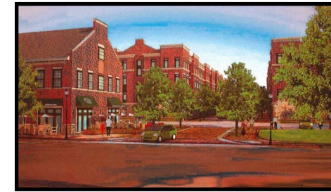
King Street Station Rendering