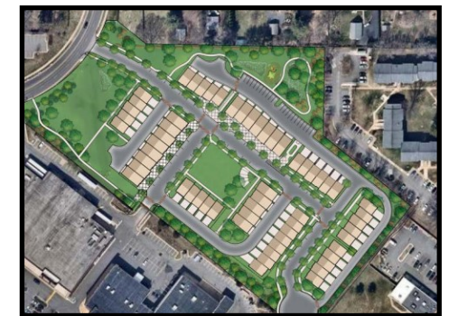
Brickyard Site Plan