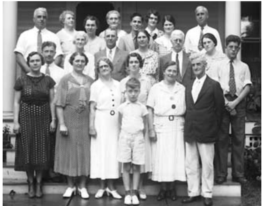
Warner Family Reunion, 1936

plans for the Thomas Balch Library include acquiring materials that will reflect the growing cultural diversity of our community and working towards automating procedures in the library. She looks forward to working not only with Balch's staff, but also the community at large.